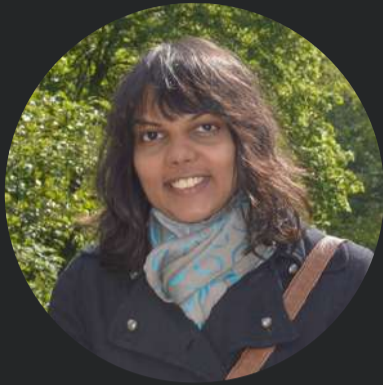
BRANDING & MARKETING