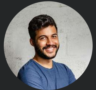
FINANCE & ACCOUNTING